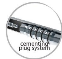
cementing plug system